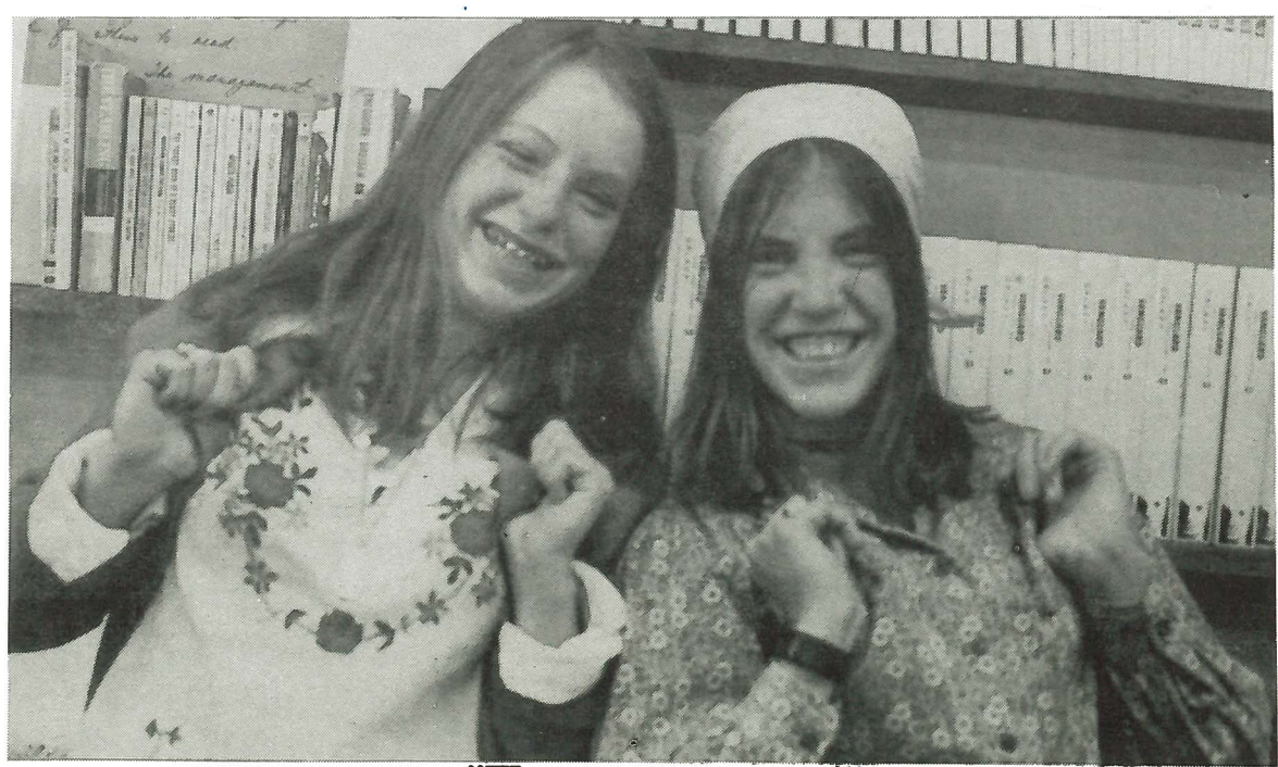
"WE GOT OUR NAME!"