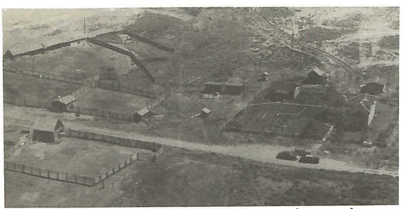
The layout of the Marshalls' ranch as seen from the air.

raceway is a big ditch-like thing that's about one hundred feet long. There are screens at each end so that the fish can't get out with the water that's running through all the time. We lose a few and a few jump out, but that's all right. Some of 'em get out into the creek, but someone will catch 'em. The first year we lined the raceway with plastic. That didn't work so well, so the second