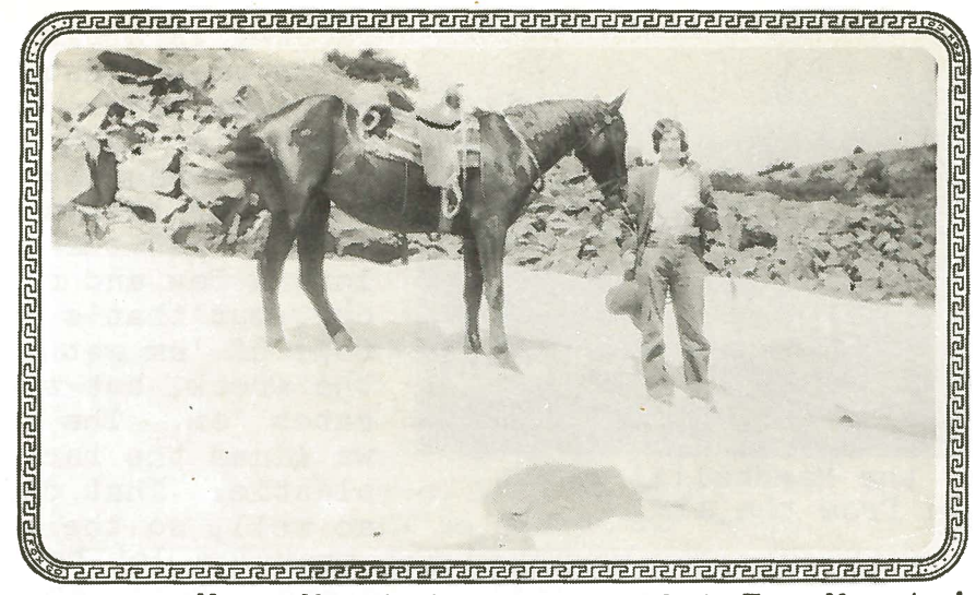
A younger Mrs. Marshall at the Flat Top Mountains.

those carts would come home full of kids. They'd all want to come up and stay at the ranch. When the kids got older, we got them regularsized horses. Then we'd all ride up to the Flat Tops together. Some awful good horses we used to ride! We had lots of pets besides horses,