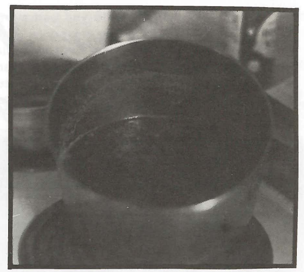
The gooseberries starting to boil.