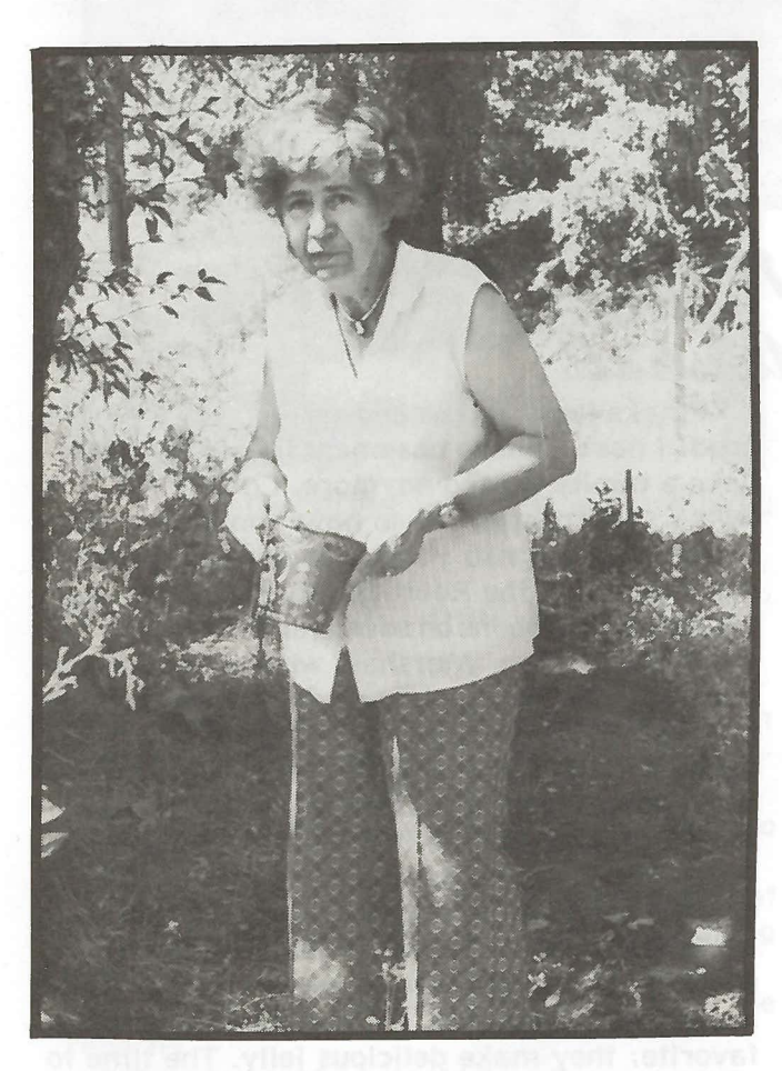
"The time to pick is early September."