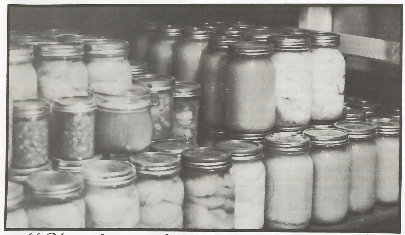
"We always have plenty of fruit."